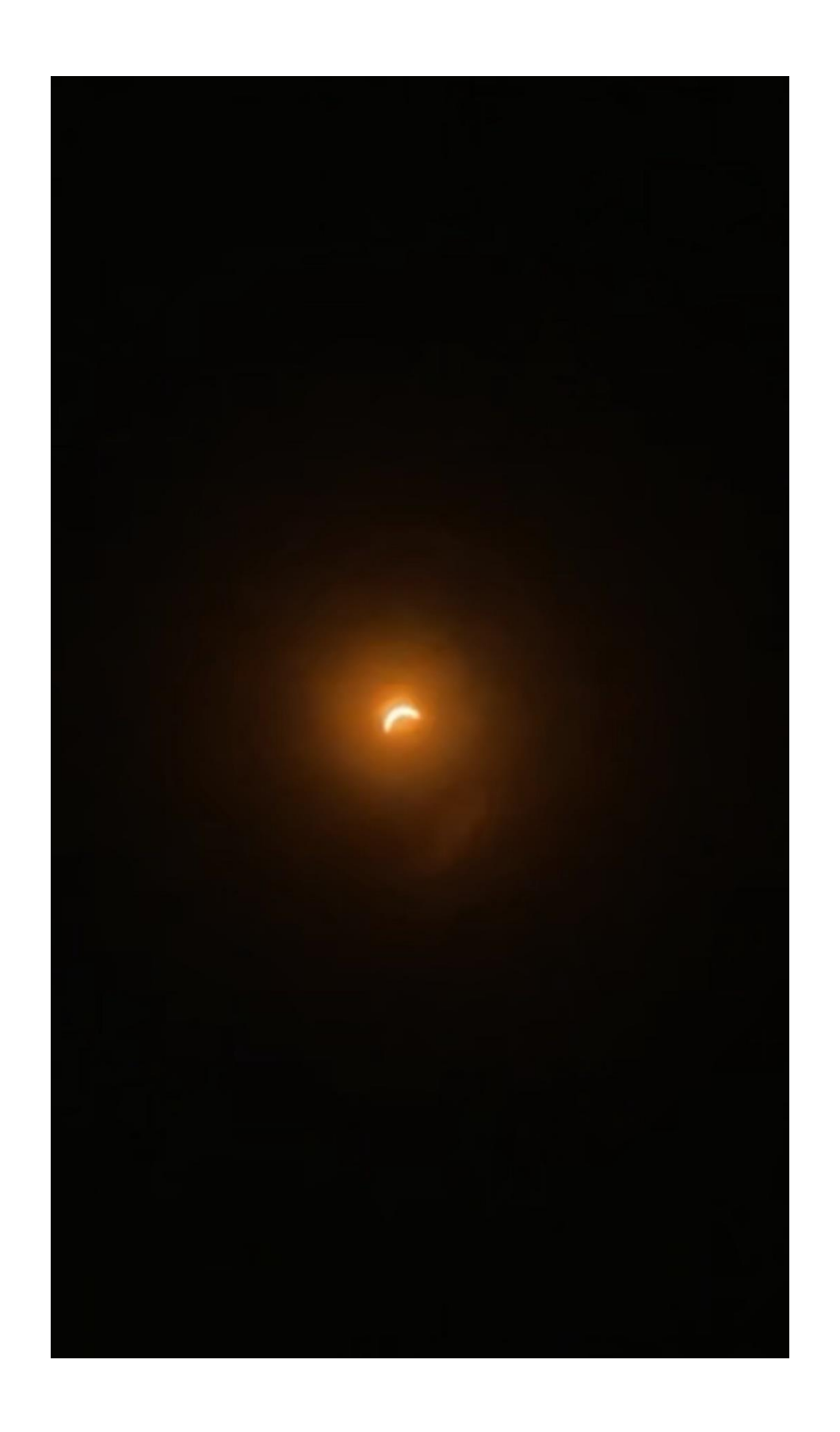
Shyanne Hicks Solar Eclipse Photograph 04.08.24